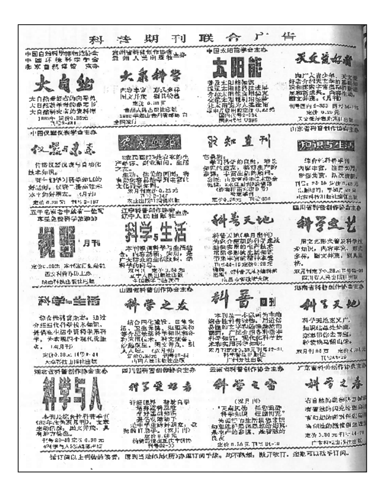
Figure 2 An advertisement for regional popular science magazines in Kexue Tiandi 科学天地 (October 1980).

its advanced technology. The 'thoughts detector' in 'After the Expert Was Assassinated' (Zhuanjia yuci yihou 专家遇刺以后) (1981), by Wang Qinlan \Xi 琴兰 and Wang Yi 王沂, reads and interprets human minds. Phase two stories are reminiscent of Sufan spy thrillers, whose paranoia about enemy infiltration is typical of the Cold War era and embodied in the frequent appearance of the spy in popular culture of both sides. In pulp science fiction of the early reform era, the spy appears less as a political traitor than as the saboteur of the economic and technological development of socialist China.