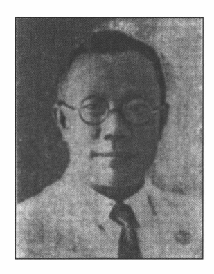
Wu Lien-teb.